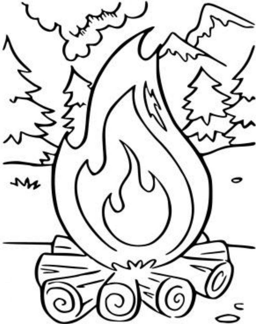
The Holy Spirit is like a fire.

Crayons and colored pencils for the picture are available in a basket at the back of the sanctuary. Please return them after church so they can be used for our next coloring picture.